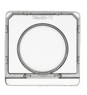
40 mm culture dish